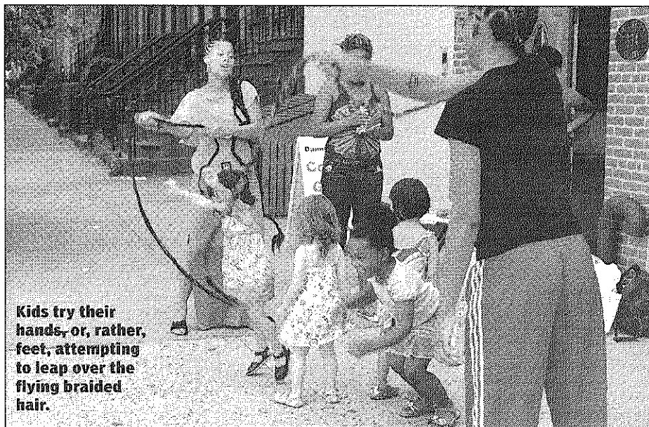
Kids try their hands, or, rather, feet, attempting to leap over the flying braided hair.