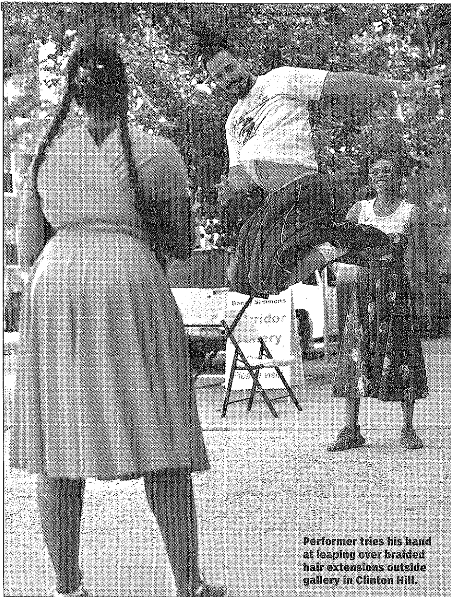
Performer tries his hand at leaping over braided hair extensions outside gallery in Clinton Hill.